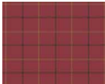
5353-R2 2½ yds