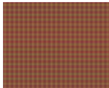
5911-R ⅜ yd