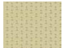
3947-V Fat ½ yd