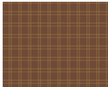
5351-N1 5 yds (backing)