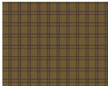
5351-GK ½ yd