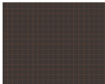
5679-N 1 yd (includes binding)