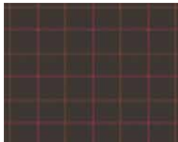
5353-N1 1½ yds