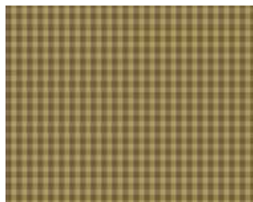
5911-G ⅜ yd