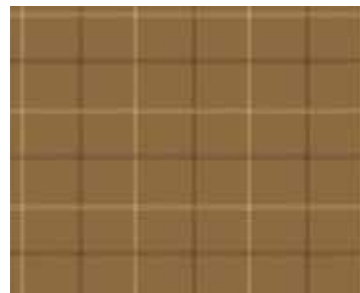
5353-N 1½ yds