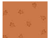
4264-LO Fat ¼ yd