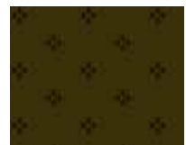
4070-G Fat ½ yd