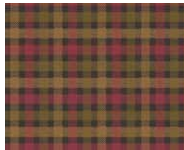
5354-N1 1½ yds